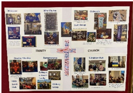
Pictures of the various church posters that were on display at Trinity Church, Enfield.